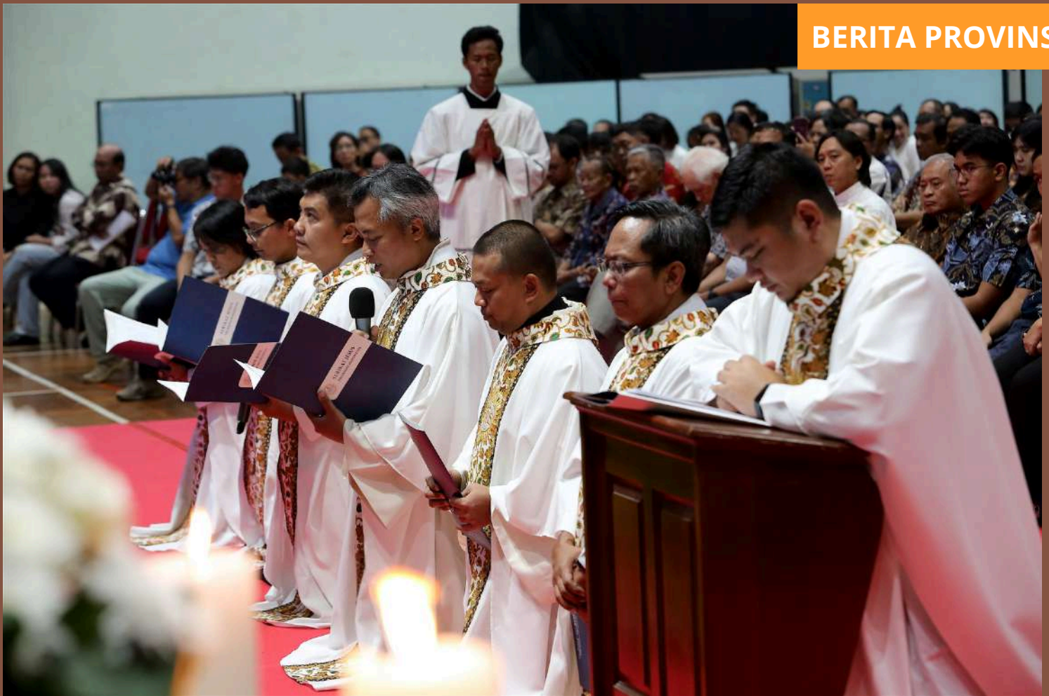
Documentation : Humas Kolese Kanisius