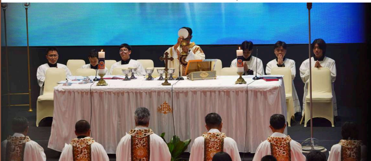
The votaries pronounce their final vows before the Provincial Father