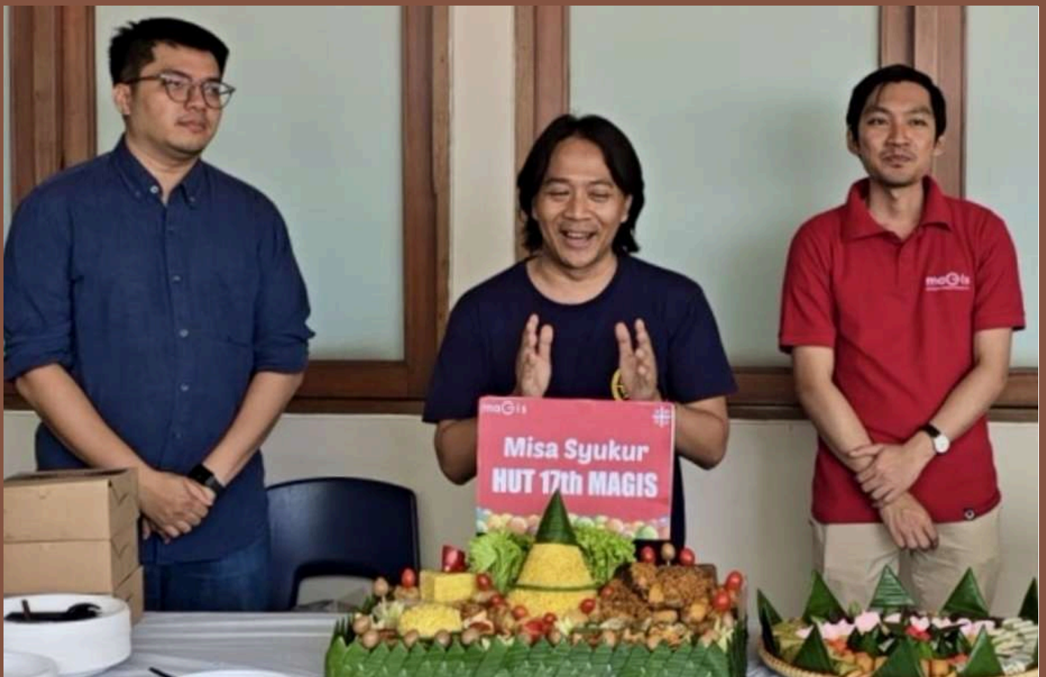
Documentation : Author