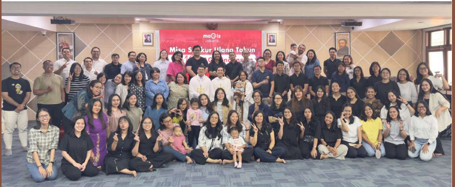
Group photo with the MAGIS Community