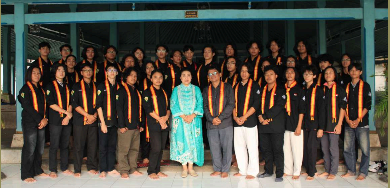
Documentation: Collese de Britto High School