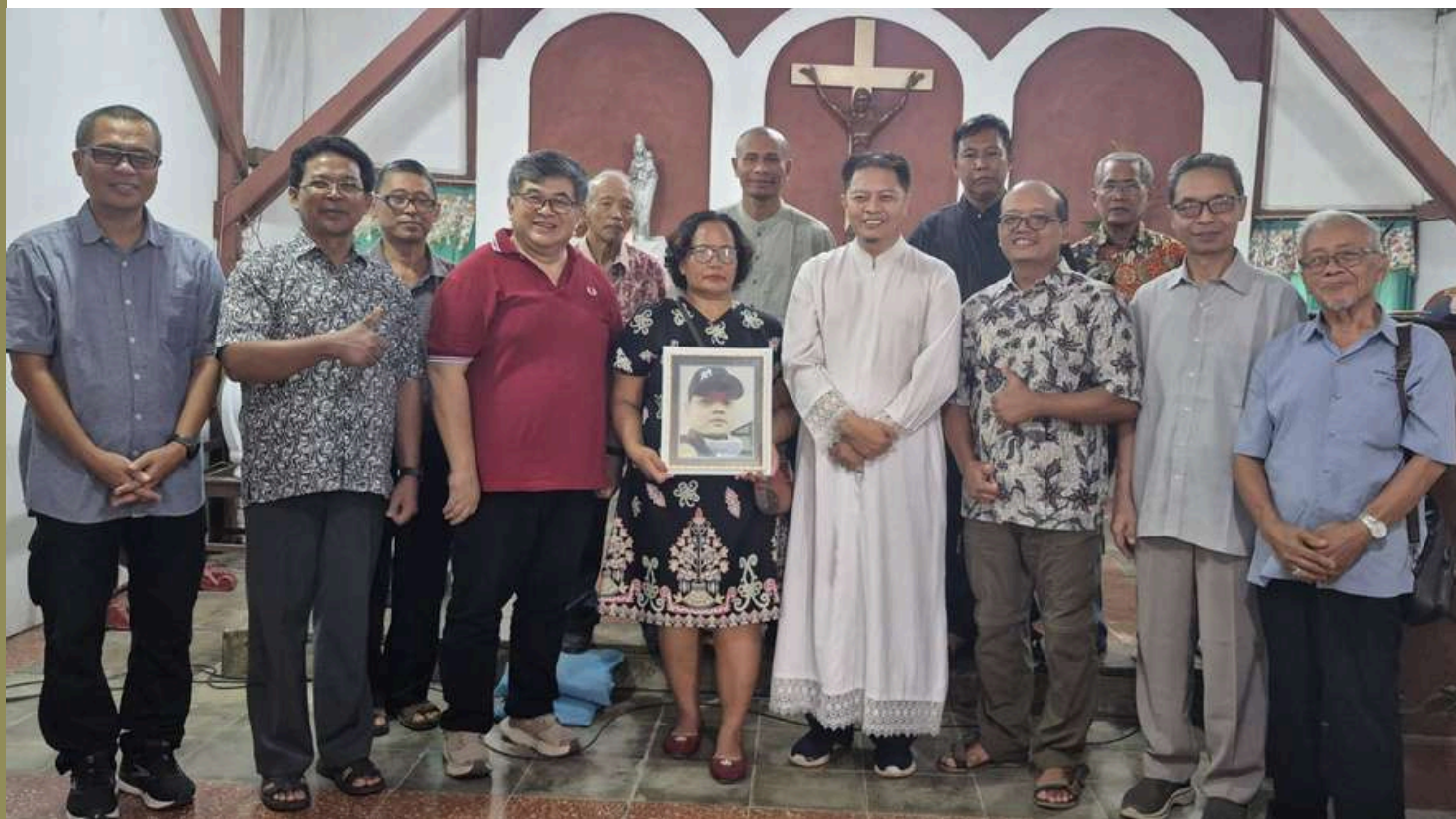
The brothers, parish priest, and the Dieng brothers' family after the Eucharistic celebration.