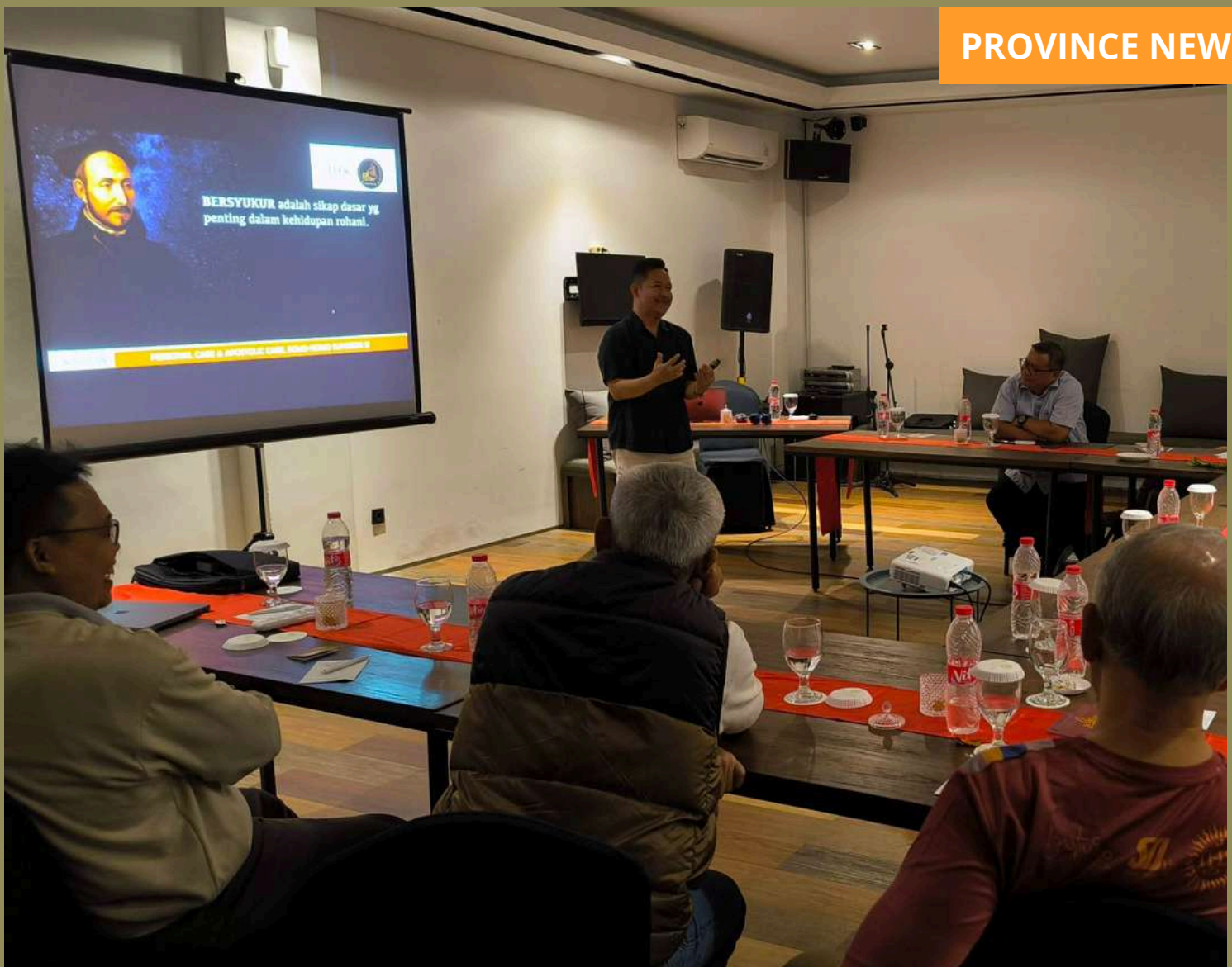
Documentation: Jesuit Indonesia