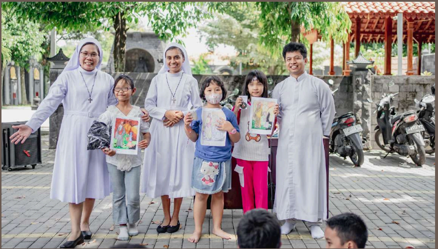
Documentation: Prompang SJ