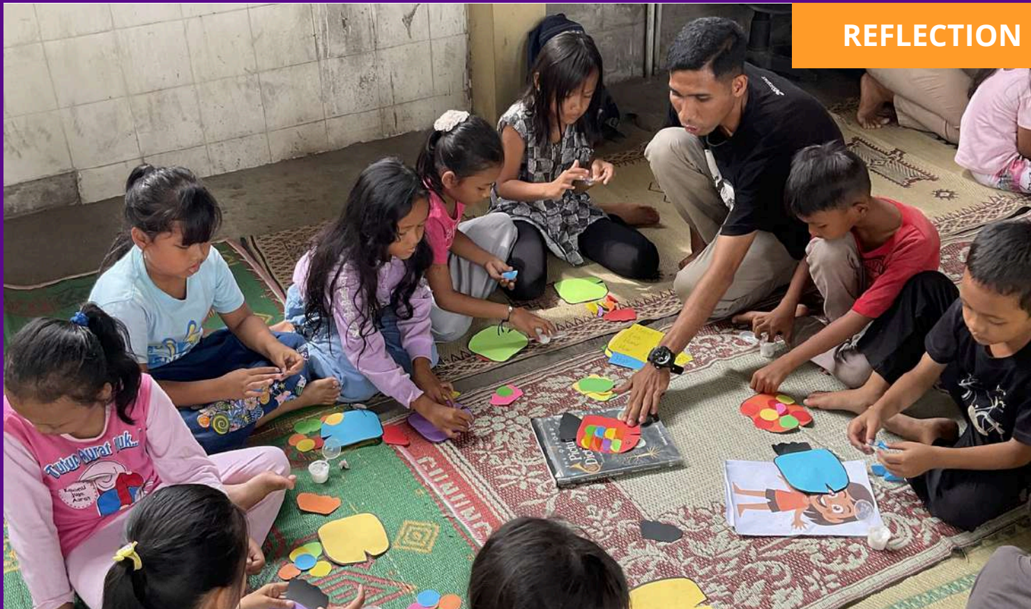
Documentation : Realino SPM